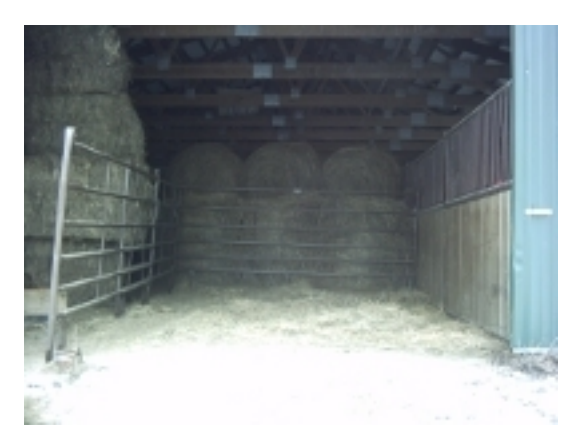
Cattle Panels Set Up For Temporary Run-in